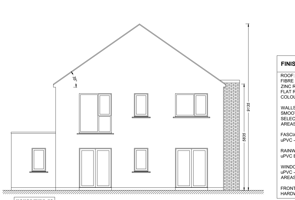
HOUSE TYPE: F2 SIDE ELEVATION